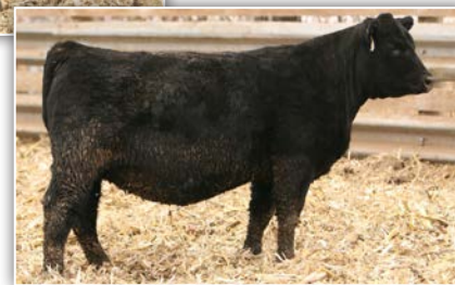
Beckers May 2353 - Lot 39