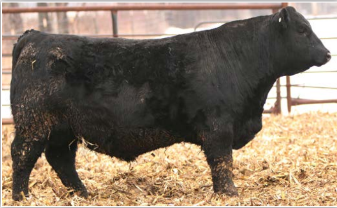
Beckers Rangland 2325 – Lot 14