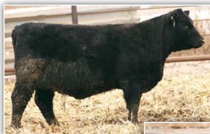
Beckers Erica 2351 - Lot 38