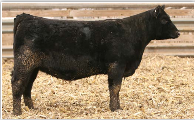
Beckers Lou Annual 2323 – Lot 33