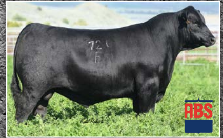
Sitz Accomplishment 720F