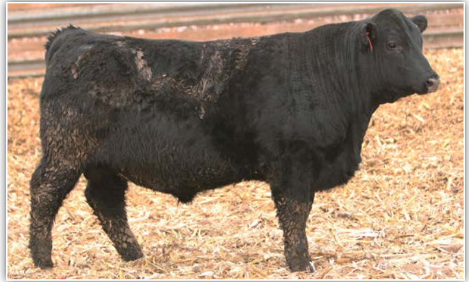
Beckers Rangland 2305 – Lot 16