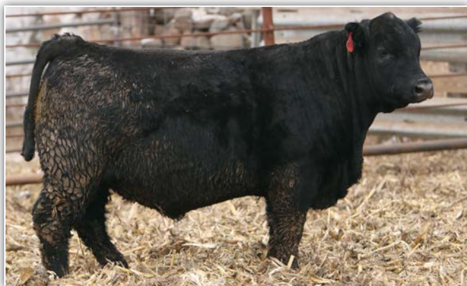
Beckers Jumbo 2332 – Lot 20