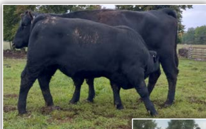
Beckers Jumbo 2332 – Pre-weaning shot with his dam.