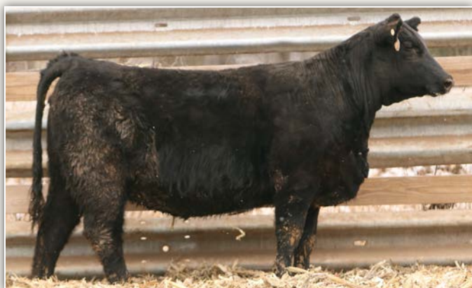
Beckers Rachal 2342 – Lot 28