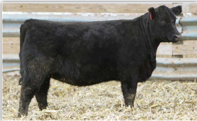
Beckers Miss Countess 2330 – Lot 31