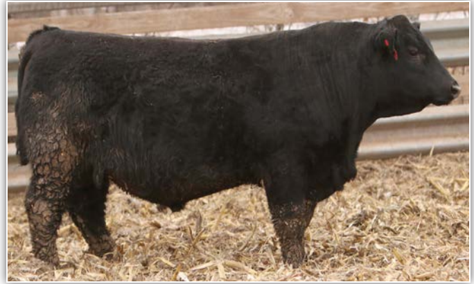
Beckers Resiliency 2316 – Lot 11