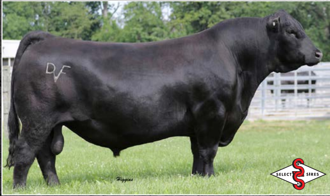
Deer Valley Growth Fund