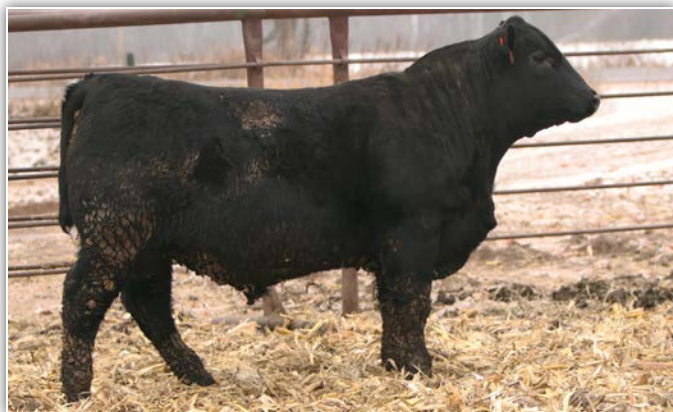
Beckers Jumbo 2335 – Lot 19

• Another double-digit calving ease with carcass strengths, CAB logo, and maternal strengths. This Musgrave bred top and bottom Jumbo bull calf goes back five straight generations of AI sires. His dam is an ET Musgrave cow, keep all of his heifers. Adj. WW 725 lbs., WR 102. His dam's production BW 5@98, WW 4@101, YW 1@104.