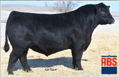
Sitz Resilient 10208