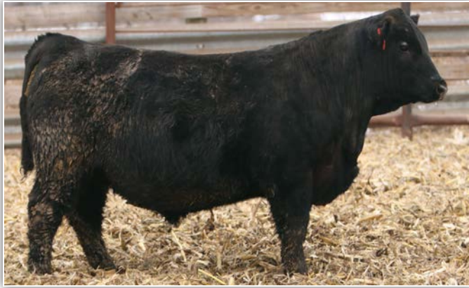
Becker Growth Fund 2309 – Lot 8