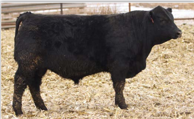
Beckers Rangland 2326 – Lot 15

Another nice double-digit, Calving Ease top 10% Rangland son. Performance WW top 25%, YW 30%, with maternal strengths top 15% HP and Milk. Adj. WW 737 lbs. His dam's production WR 2@101.