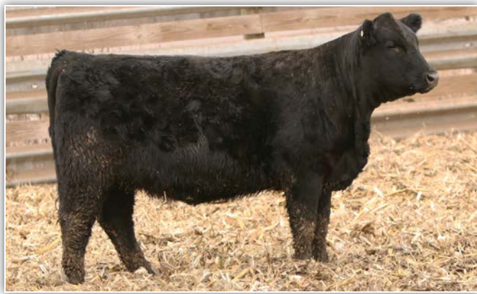
Beckers Rose 2307 – Lot 30