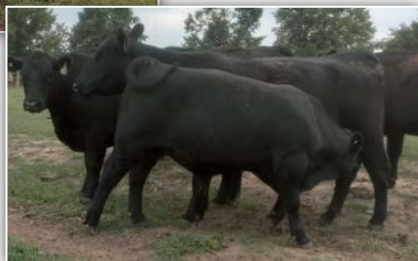
Beckers Achievement 2313 – Lot 6 with his dam.