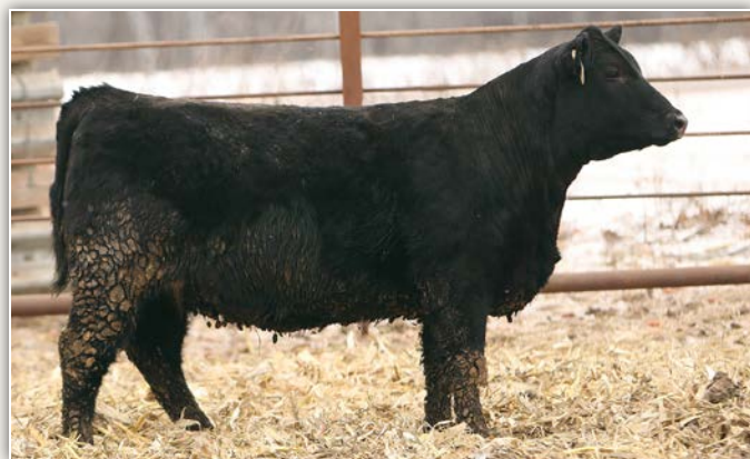
Beckers Angelina 2340 – Lot 27