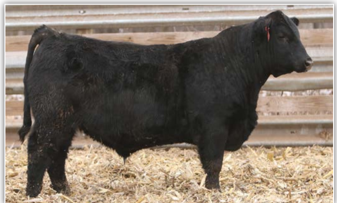
Beckers Rangland 2329 – Lot 17